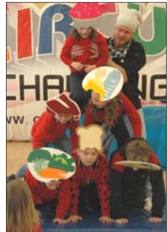
Circus Challenge human pyramid

Best wishes to you and your families for a safe and happy holiday.