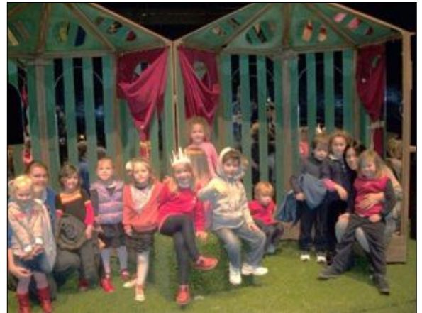
Children performing Scooby Doo at the end of term performance.