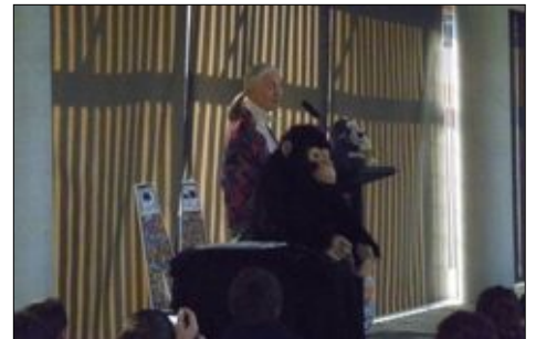
Jane Goodall at the Adelaide Zoo

We attended workshops in mixed school groups – they had names like Bilby, Mandrill, Rhinoceros and Lion. Each group did a different workshop: