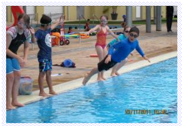
Did someone say three?