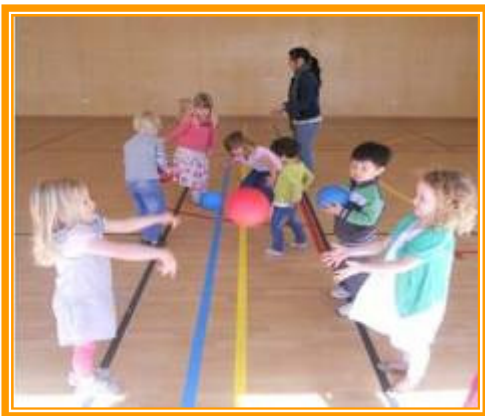
Playing team games in the school hall

This term we have been focusing on what our bodies can do with the main focus being on physical and social development. Many activities have encouraged building and strengthening individual muscles such as obstacle courses, ball games, balancing games, cutting, manipulating play dough, clay, plasticine, drawing, painting, sign language, bike riding etc. When we had practiced our new skills we had a go at team games and partner games. We have worked together to create art work, play team games and create a sign language book.