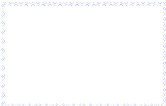
Its cool in the pool