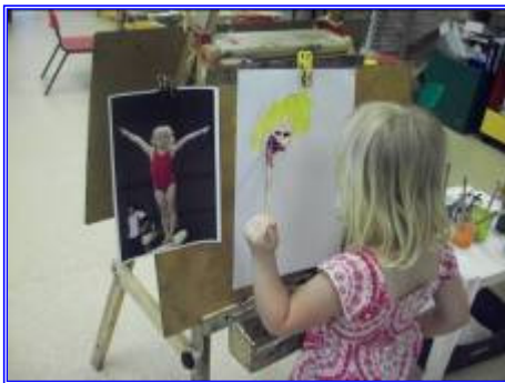
Using a picture as inspiration for a painting about what my body can do...

Our program My body can... focusing on gross and fine motor skills, is progressing well. It has been a great focus to remind us of the powerful impact of motor skills on learning. Being active and developing control of your body for gross motor and your hands, to use tools, grip pencils, draw, build and write are pivotal to children developing confidence in a whole range of other areas including literacy and numeracy development.