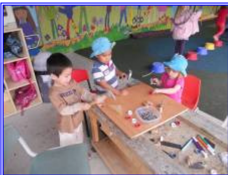
Wood off cuts needed!

Wood Off cuts wanted!!!: Does anyone have any contacts where we could get soft wood off cuts for children to use for woodwork? Hammering is a great way to develop fine motor control and eye hand coordination — but we need to find some more suitable wood.